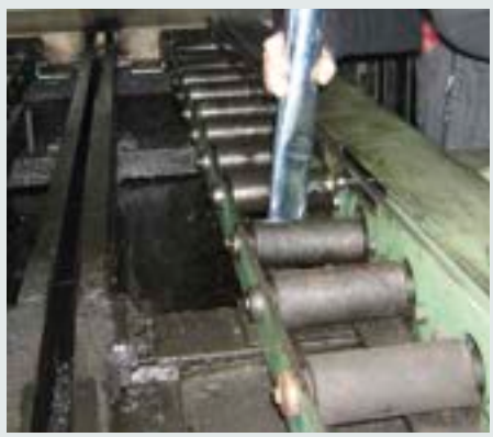
Vacuuming grinding sludge