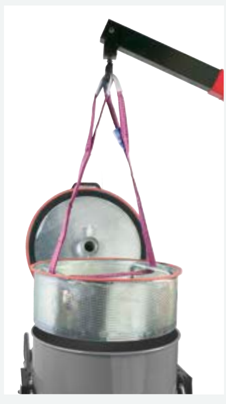
Belt for an easy lifting and emptying