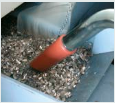
Collection of large quantities of chips