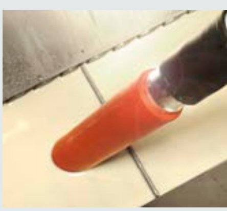
Suitable also for ceramic sector