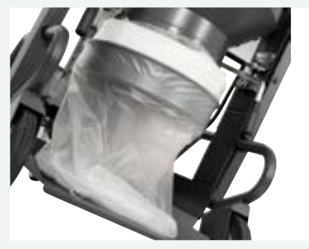
Gravity unload system with Longopac®