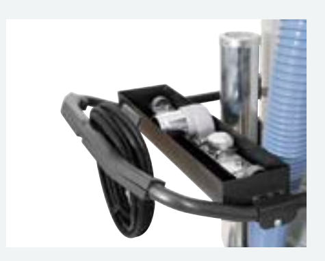
Cable holder and accessory box: functional