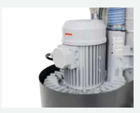
Blower: silent and reliable