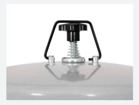
Manual filter shaker