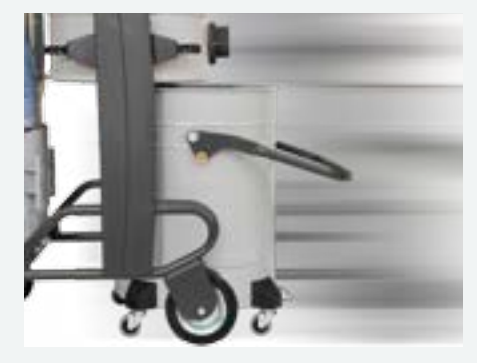
Container with castors and handle: practical